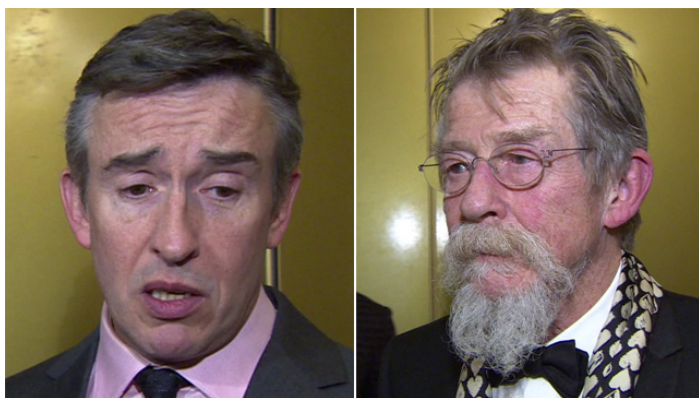
Steve Coogan and John Hurt paid tribute to an "extraordinary" talent

films. As well as films, he also starred in Broadway plays and was nominated for two Tony Awards. British actor John Hurt, who starred alongside Hoffman in the 2003 drama Owning Mahowny , said the news had hit him "very hard".